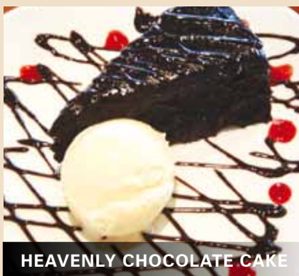
HEAVENLY CHOCOLATE CAKE

Our rich chocolate cake, with heavenly chocolate sauce and served warm with vanilla ice cream or fresh pouring cream.