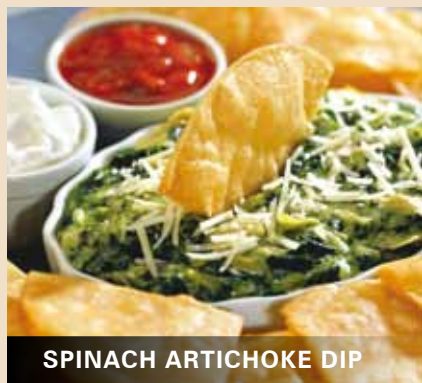
SPINACH ARTICHOKE DIP