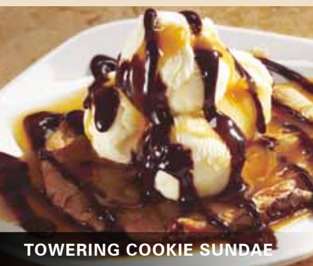
TOWERING COOKIE SUNDAE